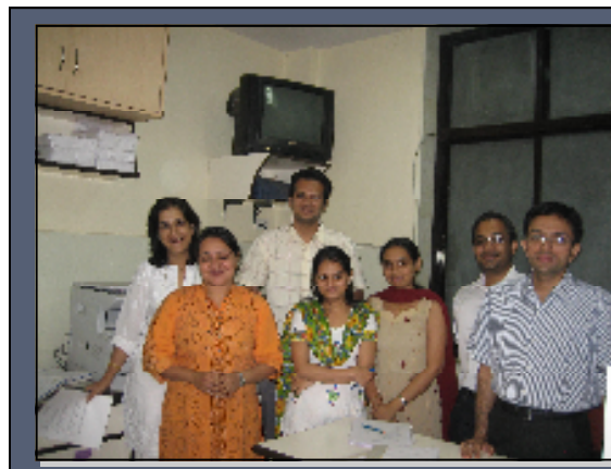
Pictured to the left:

The Memory Clinic of the Nair Hospital / Mount Sinai Dementia Research Development Project Team: (from left to right):